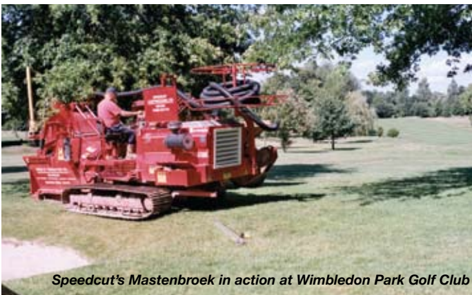
Speedcut's Mastenbroek in action at Wimbledon Park Golf Club

“With tolerance levels of only 3-5mm the laser ensures these pitches will be built to exceptionally high standards.”