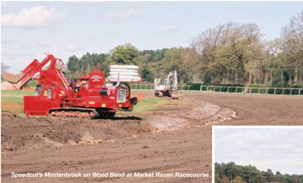
Speedcut's Mastenbroek on Wood Bend at Market Rasen Racecourse