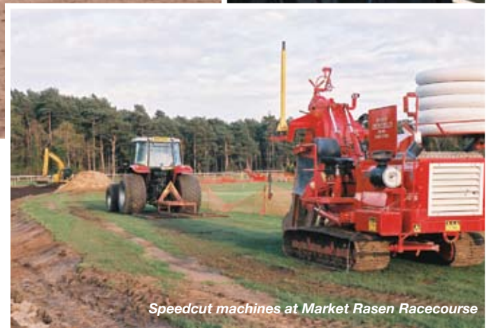
Speedcut machines at Market Rasen Racecourse

MARKET RASEN Racecourse in Lincolnshire had a bend extensively remodelled by Speedcut Contractors to overcome an adverse camber.