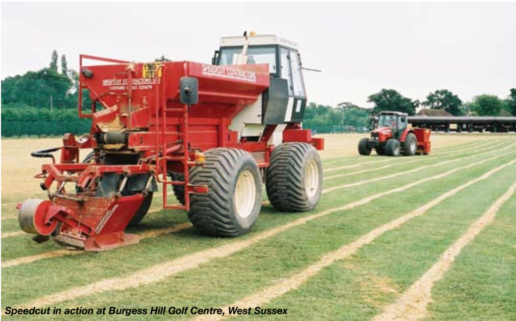
Speedcut in action at Burgess Hill Golf Centre, West Sussex

SPEEDCUT CONTRACTORS had one of their busiest-ever years with a wide variety of sportsturf projects across the UK – including many in the world of golf.