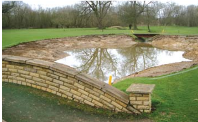
At Dyrham Park Golf and Country Club, Hertfordshire, Speedcut opened up a pond as a water feature on an existing stream that crosses by the 15th hole. They also rebuilt the tee, extending and improving visibility.