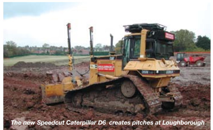
The new Speedcut Caterpillar D6 creates pitches at Loughborough

During the Championships Fortnight Wimbledon Park Golf Club becomes a car park for spectators and the course is closed.