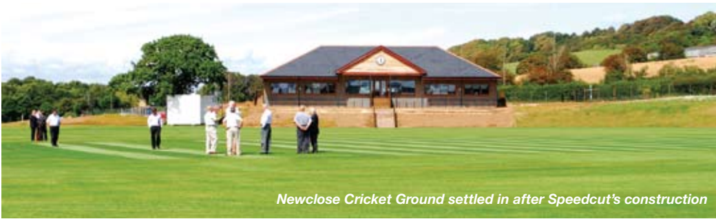
Newclose Cricket Ground settled in after Speedcut's construction

A MAJOR cricket project on the Isle of Wight has transformed life for the island's cricketers.