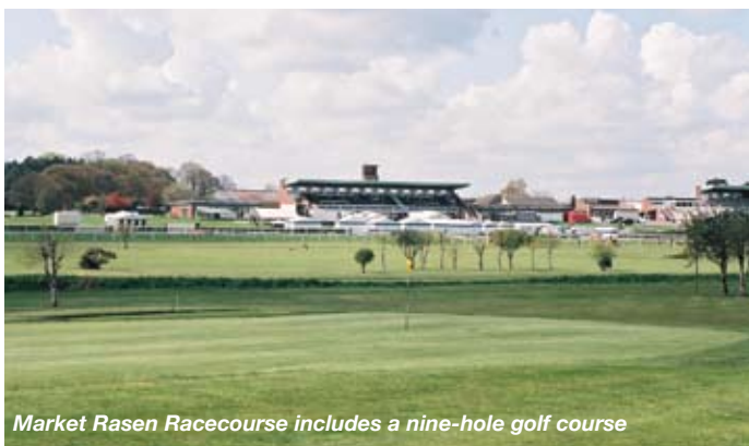
Market Rasen Racecourse includes a nine-hole golf course